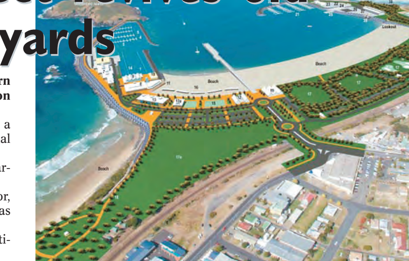
The Ocean Gem site overlooking Coffs Harbour's picturesque Jetty Precinct.

To top this off, Hutchies also won the Delfin Lend Lease Best Display Home Northern Australia (Cairns, Darwin and Townsville).