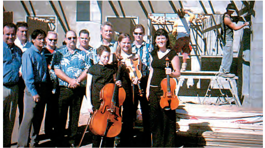
Building sites and Chamber Music recitals are as far apart as anyone could imagine, but they moved a step closer together recently, with Hutchies' sponsorship of Townsville's Chamber Music Festival.

HUTCHIES won two High Commend ation Awards in the Australian Institute of Building Excellence Awards.